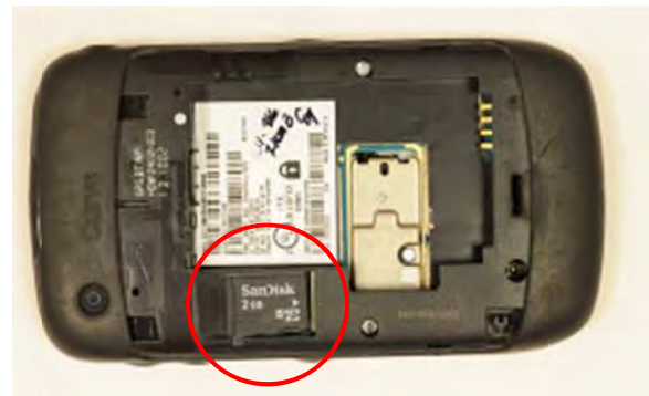
Figure 3 – MicroSD Card