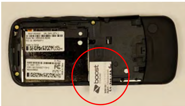
Figure 2 – SIM Card